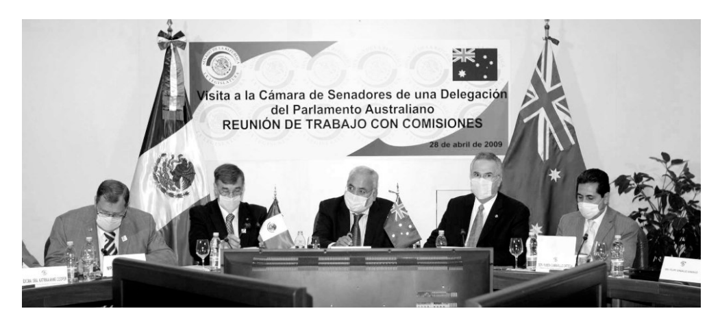
Delegation discussions at a roundtable discussion arranged by Senador Carlos Jiménez Macías

3.33 Senador Carlos Jiménez Macías, Chairman Senate Committee on Foreign Affairs, Asia-Pacific convened a roundtable discussion between the delegation and a group of Senators. The delegation discussed the importance of cultural, economic and education exchanges between the two countries. Mexico is a strong proponent of a global free market and the Mexican Senators were proud of the large number of free trade agreements to which Mexico is a signatory to, stating that it would not be in the countries interest to go back to protectionism and that the global economic crisis should not be used as an excuse to close economies. Australia's efforts in developing trade agreements, as well as its support for the ongoing Doha round of World Trade Organisation negotiations, were also acknowledged.