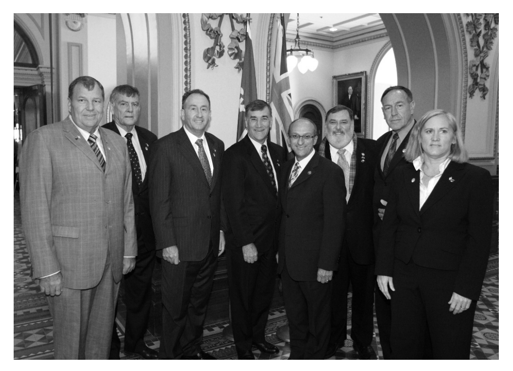
The delegation with the President of the National Assembly of Québec, Mr Yvon Vallières, MNA

2.18 The delegation was pleased to meet with the President of the National Assembly of Québec, Mr Yvon Vallières, MNA. The delegation noted the importance of maintaining parliament-to-parliament links and discussed the role of provincial parliaments in the Canadian federation, and the important role of Québec in the political and economic development of Canada.