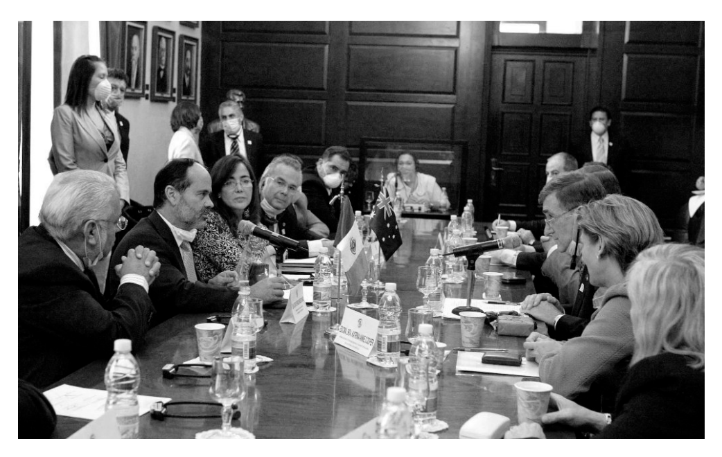
The delegation meeting with the President of the Mexican Senate, Sr Gustavo Madero Muñoz

country; the importance of economic and trade links with Australia; and the recent Australian Expo, a two-day trade show showcasing Australian education.