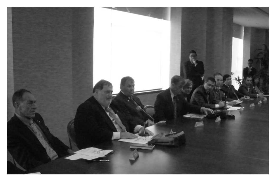
The delegation meeting with the Governor of Hidalgo State, Gobernador Miguel Ángel Osorio Chong

Governor noted that the refinery will be built in Tula and will create 18,000 direct and 80,000 indirect jobs over a five year period. He noted that new investments, particularly in infrastructure, are helping to bring down the unemployment rate. Other significant investment activity occurring in the region is the development of a trucking and container business near the oil refinery creating an additional 10,000 direct and 100,000 indirect jobs. Hidalgo State gained first place for the generation of jobs in Mexico last year and was the top generator of jobs in the first quarter of 2009. Whilst most of the Mexican states were suffering job losses, Hidalgo is one of four to create jobs.